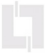
PLATE SWITCH SYNERGY -3 GANG -2 WAY -20 AX -250 V~ - AUTHENTIC POLISHED STAINLESS STEEL