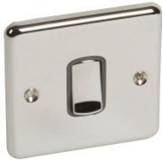
PLATE SWITCH SYNERGY -1 GANG -2 WAY -10 AX -250 V~ - AUTHENTIC POLISHED STAINLESS STEEL