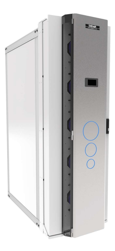
Over 200kW In A Single Rack